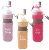
Misting Water Bottle $10

*As stock is limited on the day and to avoid any disappointment, please advise children to choose an item based on what is available at the stall when they arrive to make a purchase.