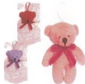
Mum's Teddy Bear $4