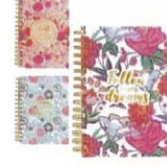
A5 Spiral Notebook $6