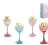
Mum's Glass $8