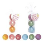
Shimmer Trio Bath Bombs (3pk) $5