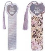
Grandmother Tassel Bookmark $3