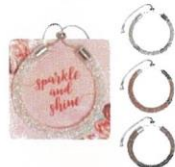
All That Glitters Bangle $5.50