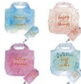
Foldable Shopping Bag $7