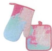
Pot Holder & Oven Mitt Set $9