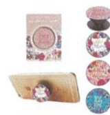
Mobile Phone Pop Holder $5