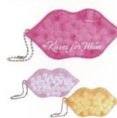
Kisses for Mum Mints $2