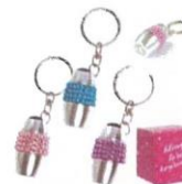
Bling Torch Key Ring $5