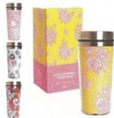
Go Go Thermal Travel Mug $10