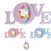
Love Photo Frame $5